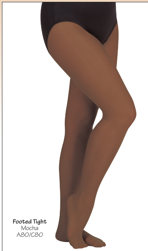
Footed Tight Mocha A80/C80