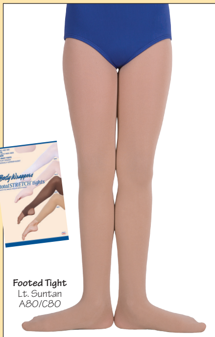
Footed Tight Lt. Suntan A80/C80