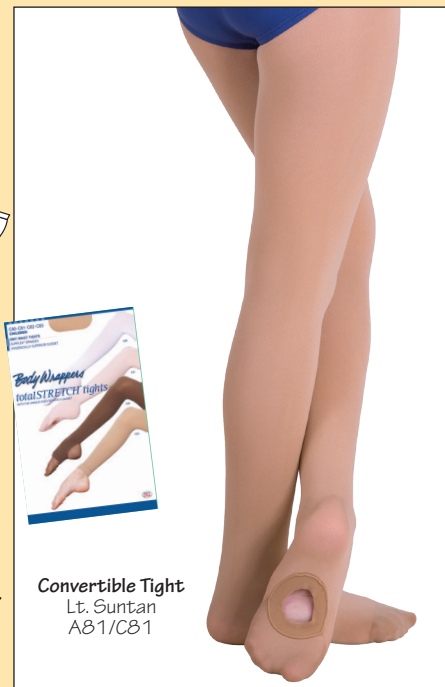
Convertible Tight Lt. Suntan A81/C81