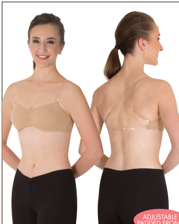
ADJUSTABLE PADDED FRONT

totalSTRETCH® Padded Bras are an 88% Matte Nylon, 12% Lycra® ultra soft, supportive and lightweight flesh tone grouping of bodywear, intended to be worn as a second skin under tight fitting clothing. The removable, adjustable, detachable straps are a clear elastic that reflects the color of the wearers skin tone. Please note new color listed in Red.