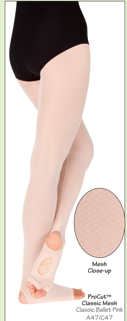
ProCut™ Classic Mesh Classic Ballet Pink A47/C47