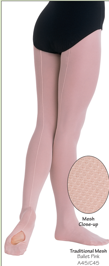
Traditional Mesh Ballet Pink A45/C45

TIGHTS ARE PACKAGED 3 PCS. PER SIZE AND COLOR.