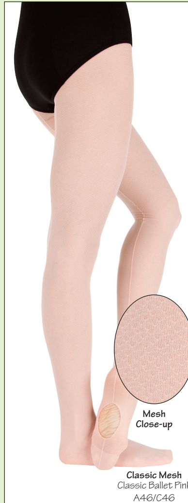
Classic Mesh Classic Ballet Pink A46/C46