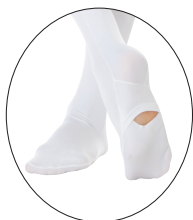
M90 Convertible Tight

DANCE BASICS are in stock. Mens: S, M, L, XL. Boys: 5-6, 7-8, 9-10, 11-12, 14-16. Unless indicated.