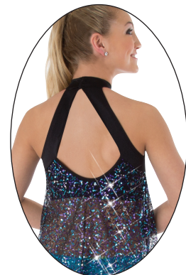
Style 7351 Back View