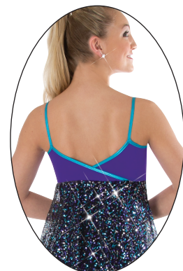
Style 7350 Back View