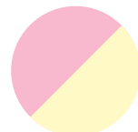
Lt. Pink w/ Lemon