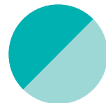
* Seafoam w/ Lt. Blue Start ship 4/15/12.