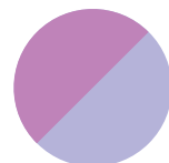
* Magenta w/ Lilac Start ship 4/15/12.