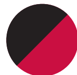
Black w/ Scarlet

Premiere Performance Dresses are in stock, • New colors start ship 4/15/12.