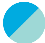
Turquoise w/ Mint