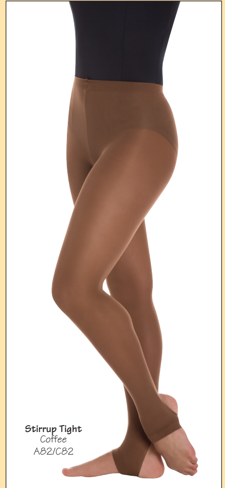
Stirrup Tights Coffee A82/C82