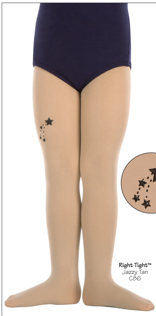
Right Tight™ Jazzy Tan C86