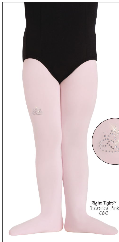
Right Tight™ Theatrical Pink C86