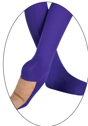
Sewn-in Suede Sole