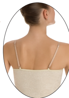
Adjustable Shoulder Straps