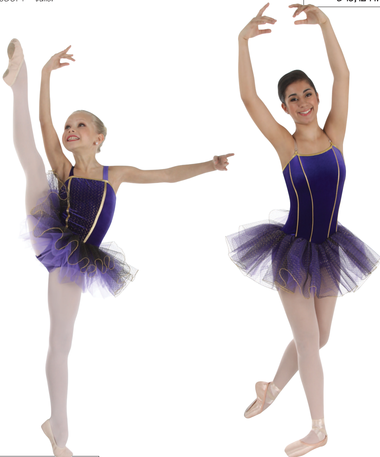
A. GIRLS 3141

GIRLS DEEP PURPLE CAMISOLE TUTU HAS A SEAMED VELVET BODY WITH A GOLD ZIG-ZAG PATTERNED CENTER INSERT, GOLD BINDING SEAMING AND TRIM, A memorySTRETCH™ BODICE FRONT, A GOLD ZIG-ZAG PATTERNED TOP TUTLE WITH A DEEP PURPLE soSOFT™ UNDER TUTLE AND SELF VELVET STRAPS.