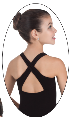
Back View Style 2624