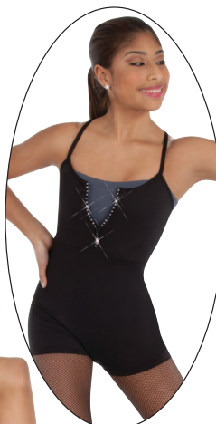
Open Zipper View