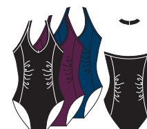
Style P342 Halter U-Neck Leotard